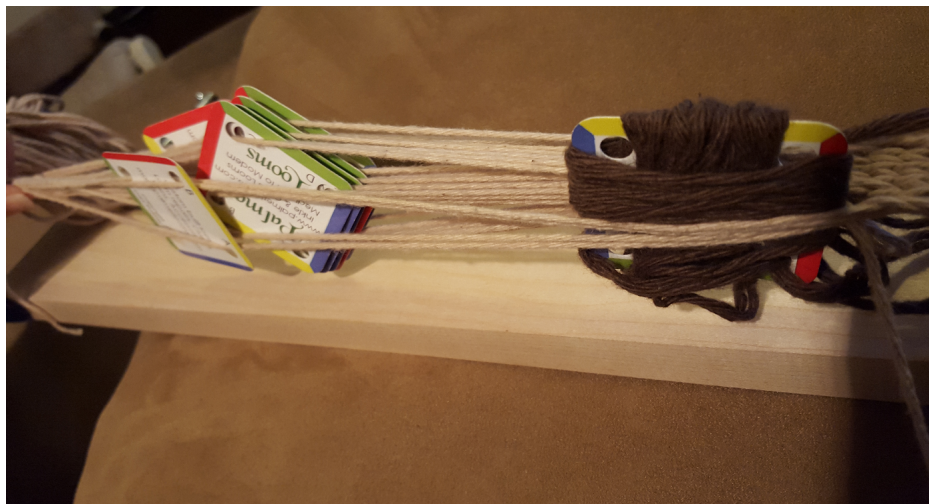
Illustration 4: Bring brocade weft down inside border cards.