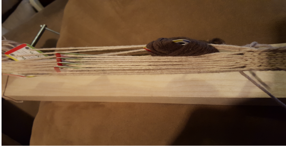
Illustration 2: Bringing brocade weft up inside of border