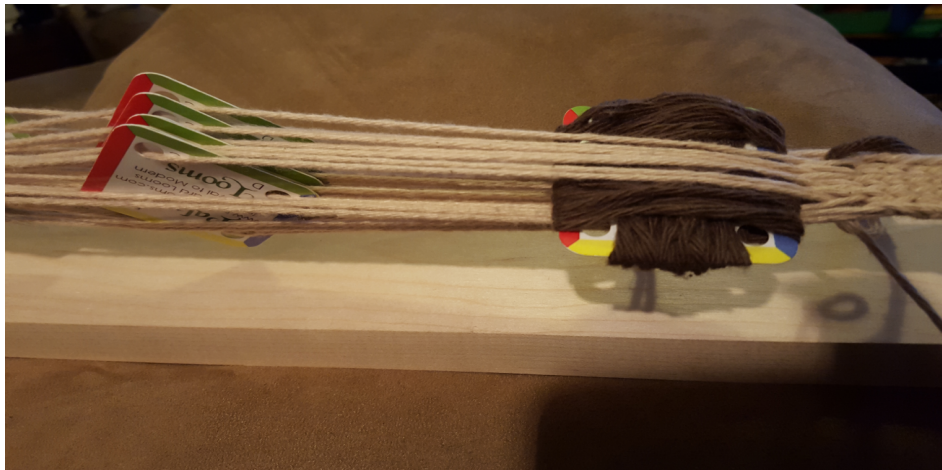
Illustration 3: Pass brocade weft through brocade shed