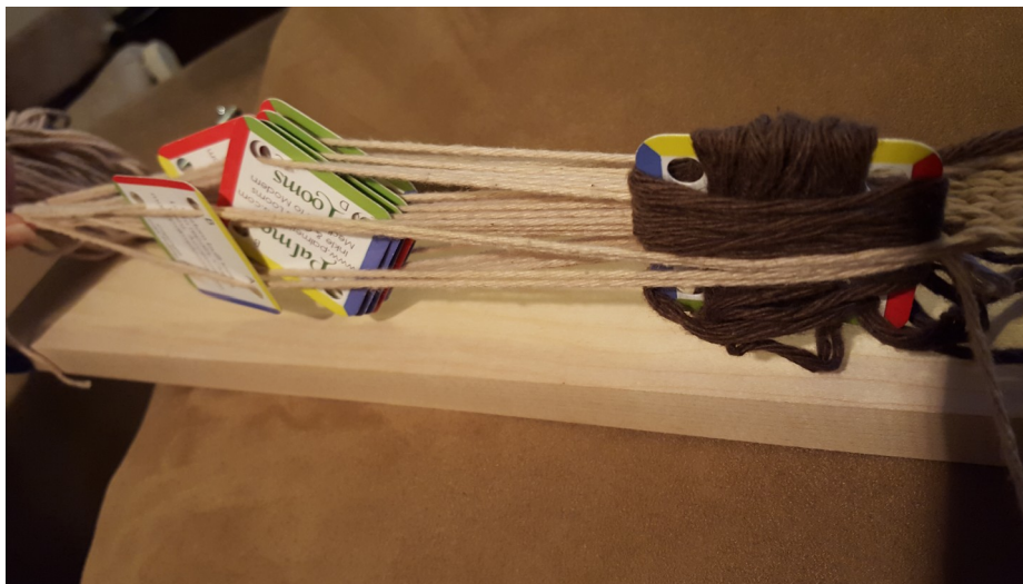
Illustration 4: Bring brocade weft down inside border cards.