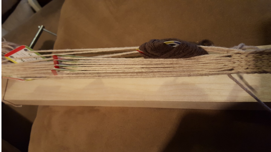
Illustration 2: Bringing brocade weft up inside of border