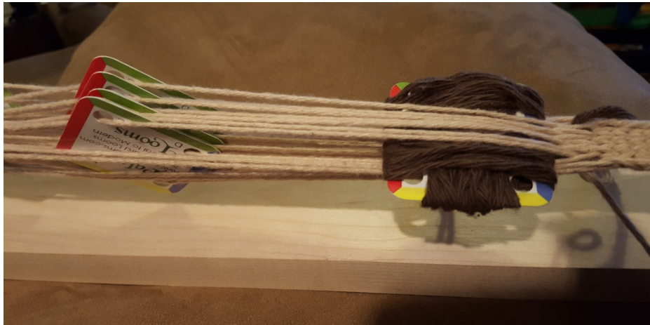
Illustration 3: Pass brocade weft through brocade shed